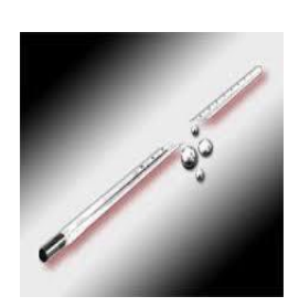
Hg-thermometer returnable at the "Ausgabe"