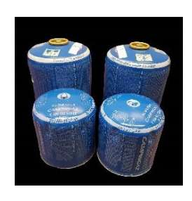
empty gas cartridges returnable at the "Ausgabe"