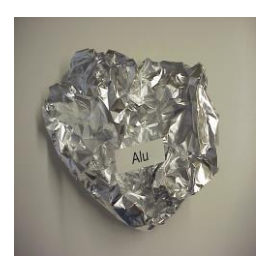
aluminum in the collecting boxes in the main stairway