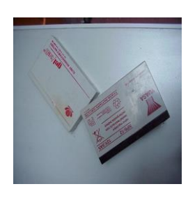
lead rechargeable batteries returnable at the "Ausgabe"