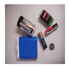
batteries in the brown box on the table beside the "Ausgabe"