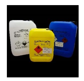
full waste solvent canisters in the U1, at the bunker, on the waste rack