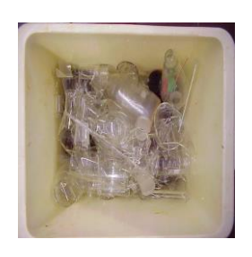
used glass (rinsed) in the blue waste glass containers on the place (U1) behind the building