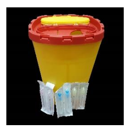
needles and syringe boxes needles in yellow box into