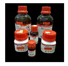
lab pack it to prevent breakage into the white bucket, label it and put it in U1 at the bunker on the waste rack