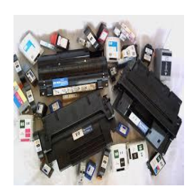
empty colour cartridges & toner cartridges returnable at the "Ausgabe"Abgabe an der