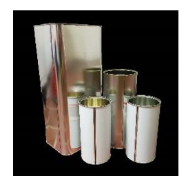
empty tin canisters in U1, at the bunker, on the waste rack