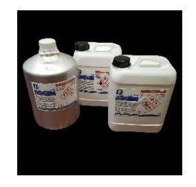
empty solvent canisters in the cart beside the "Ausgabe"